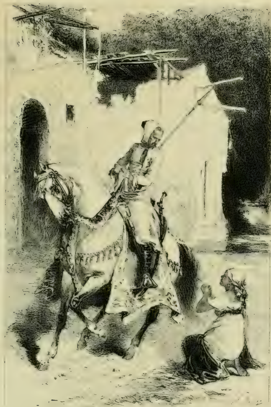
A. Lalage, Engraver.